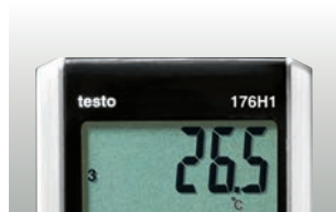
Large, clear display for showing measurement values